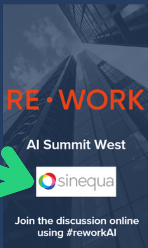
EXHIBIT HALL FLOOR STICKERS